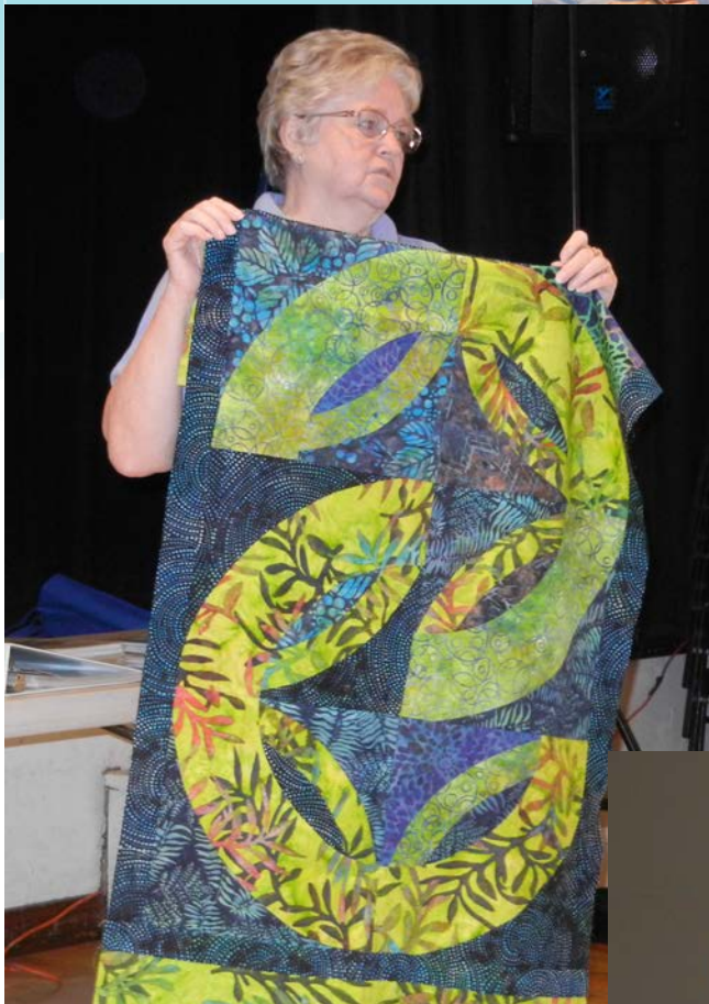
Photo to right is a sample of (cranes) the block that will be used for the 2018 Art in the Redwoods quilt.