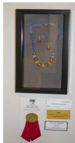
Kathryn Weiss Second Place Glass Category