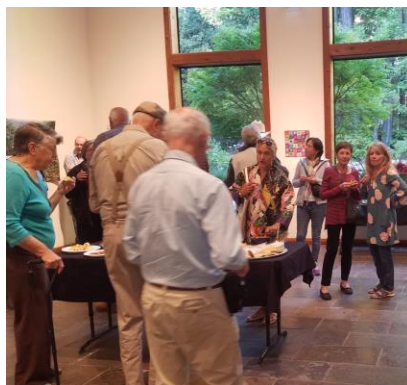
At the opening reception for "One Red Square"