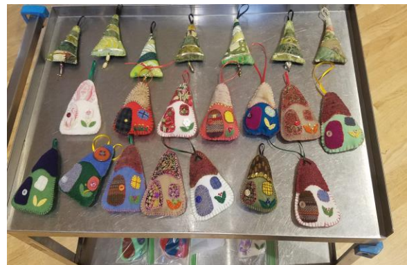
Tree ornaments made by guild members for the PPQG tree to be displayed at Festival of Trees.