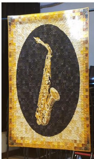
Sample of Colleen's work