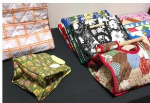
Quillow, Lunch Bag, Casserole carriers