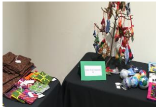
Tablerunner w/8 napkins Coasters, Ornaments