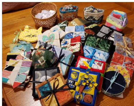
Coasters received at the April turn-in: