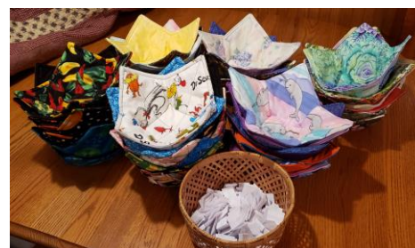
Microwave Bowls received at the April Turn-in:

You ladies are awesome! Notice how the ticket basket is getting fuller each month!