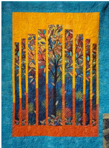
"New Beginnings: Forest Sunrise" By Della Zita First Place