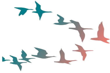
Exhibit Location Burnett Gallery & Jacob Foyer Exhibit Date Range 10/01/2021 – 11/07/2021

Submit Registration Form 09/24/2021 Take-In & Hang Exhibit 9/29 – 9/30/2021 Members Preview 10/01/2021 Public Reception 10/02/2021 Take Down Exhibit 11/08/2021 & Pick-up Your Entry