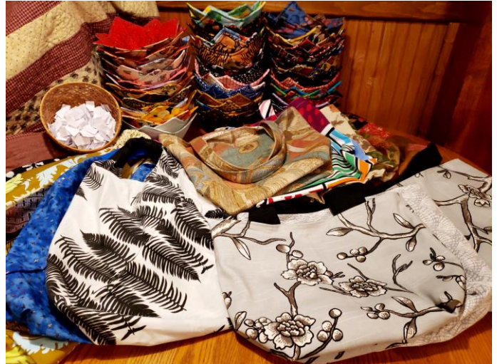
Bags and Bowls received for July turn-in