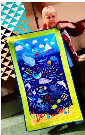
Kalynn Oleson, Seascape