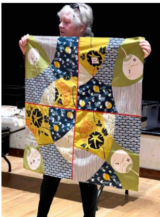
Sylvia Evans – Asian From workshop