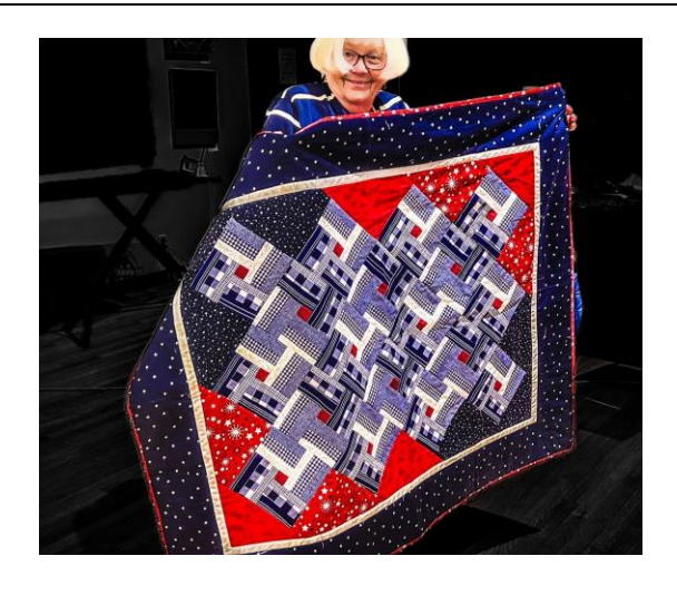
Janice Batchelder - Comfofrt Quilt